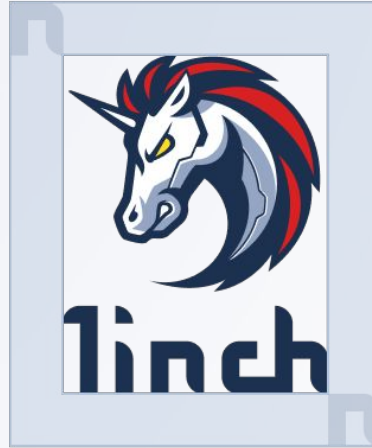
Vertical lock-up exclusion zone