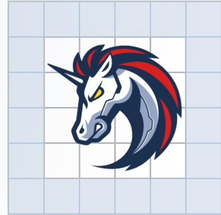
Symbol exclusion zone